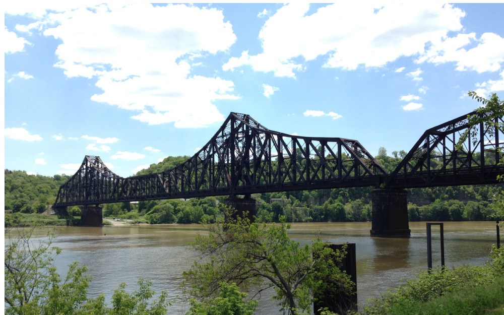
Beaver railroad bridge today