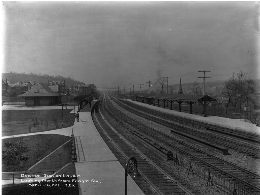
Beaver Station, now Heritage Museum