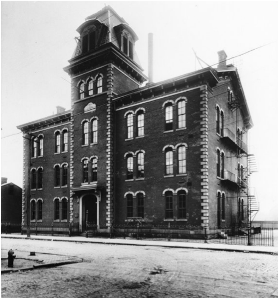
Woods Run School

In 1873 a new and more spacious building was built, located at Westhall Street near Preble Avenue in the Ninth Ward, with twelve rooms and large hall at a cost of $40,000 to house the increasing student body. Woods Run School was closed in February 1965 and sold to the Urban Redevelopment Authority in May 1974.