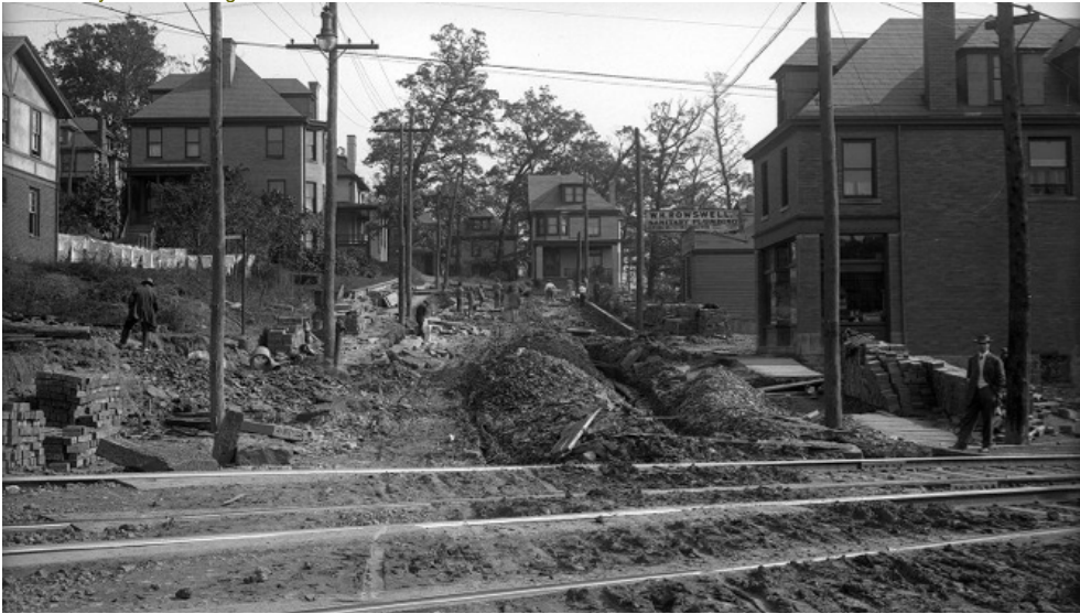
Road improvements on Hampshire Avenue from Suburban Avenue, October 28, 1912

Named for the many beech trees found on its hillsides, Beechview was originally settled by Scotch-Irish and English pioneers in the late 1700’s. Welsh and Irish settlers soon followed working in the many local coal mines. The mid 1800’s saw the arrival of German truck farmers. A small German community known as Seldom Seen developed adjacent to Beechview. Italian and Jewish families began arriving in Beechview before World War I. Today the population reflects a rich racial and ethnic diversity.