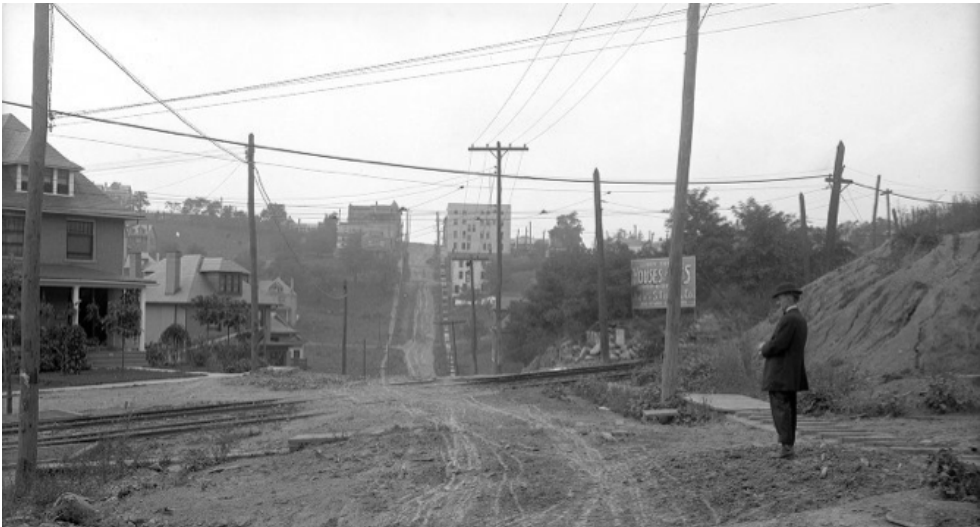
View of Hampshire Street at Rockland Street looking toward Suburban Avenue, August 22, 1912